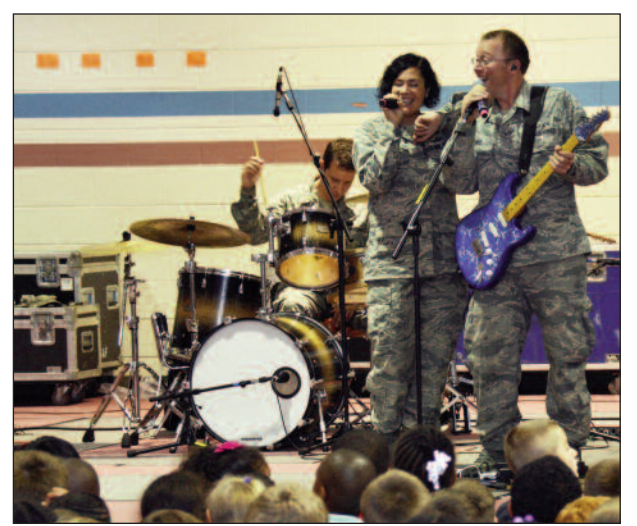
eserve performs at Shirley Hill

"I think all of us should be able to take