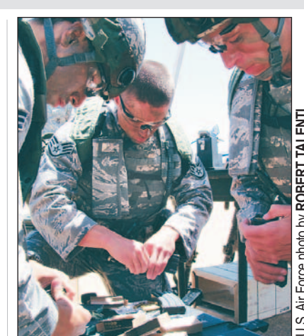
Members of the 689th CCW Guardian Challenge Security Forces team load ammunition rounds in preparation for a competitive tactics event.

Combat communication Airmen deploy tactical communications, computer systems, navigational aids, air traffic control services and organic power production/HVAC anywhere in the world in support of the Air Force, DOD, and other U.S. commitments. The elements of the 689th CCW are self-sustaining and able to independently operate from the initial phases of an expeditionary or "bare base" mission until relieved by additional forces.