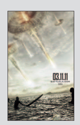
TODAY 7 P.M. BATTLE: LOS ANGELES PG-13