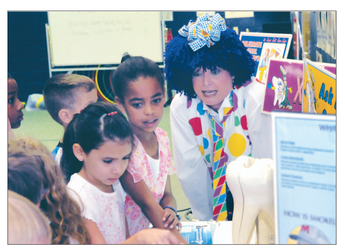
Polka Dot the clown, talks to children at Robins Elementary about good dental health Feb. 12. Representatives from the 78th Dental Squadron visited the school as part of National Children's Dental Health Month.