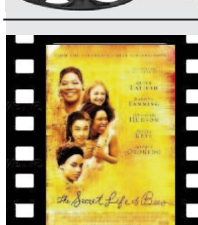
FEB. 20 — 7:30 P.M. THE SECRET LIFE OF BEES RATED PG-13