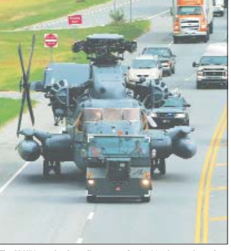
The M-H53 received a police escort for its 30-minute trip to the Museum of Aviation Aug. 21.

The National Association of Old Crows Chapter Awards recognize individuals and units that have furthered the aims of the Association of Old Crows