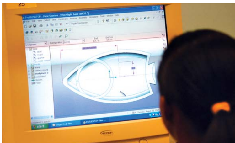
At left, Students use a computer aided design program to design a flashlight that will be created in the 3-D printer.