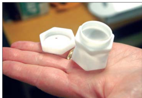
At right, This container is another example of what can be produced by the 3-D printer.