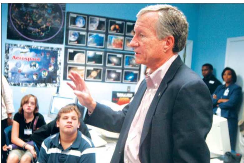
Rep. Jim Marshall, D-Ga., talks with Northside Middle School students who are involved in the STARBASE Robins program.