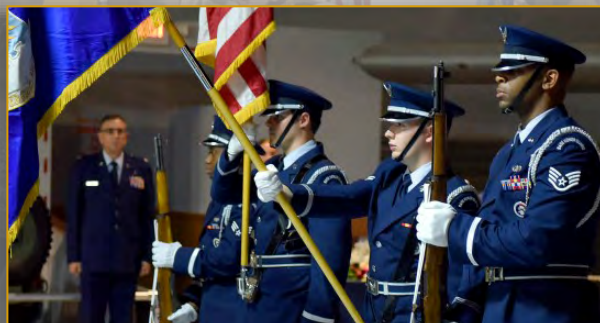
The Robins Air Force Base Honor Guard presents the colors at the opening of the 78th Medical Group Dental Squadron inactivation ceremony.