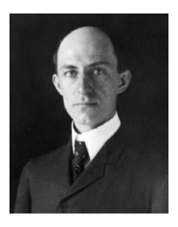
Wilbur Wright in 1909