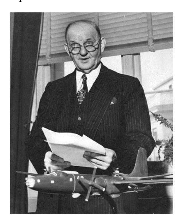
Powerful Georgia Congressman Carl Vinson, 1949