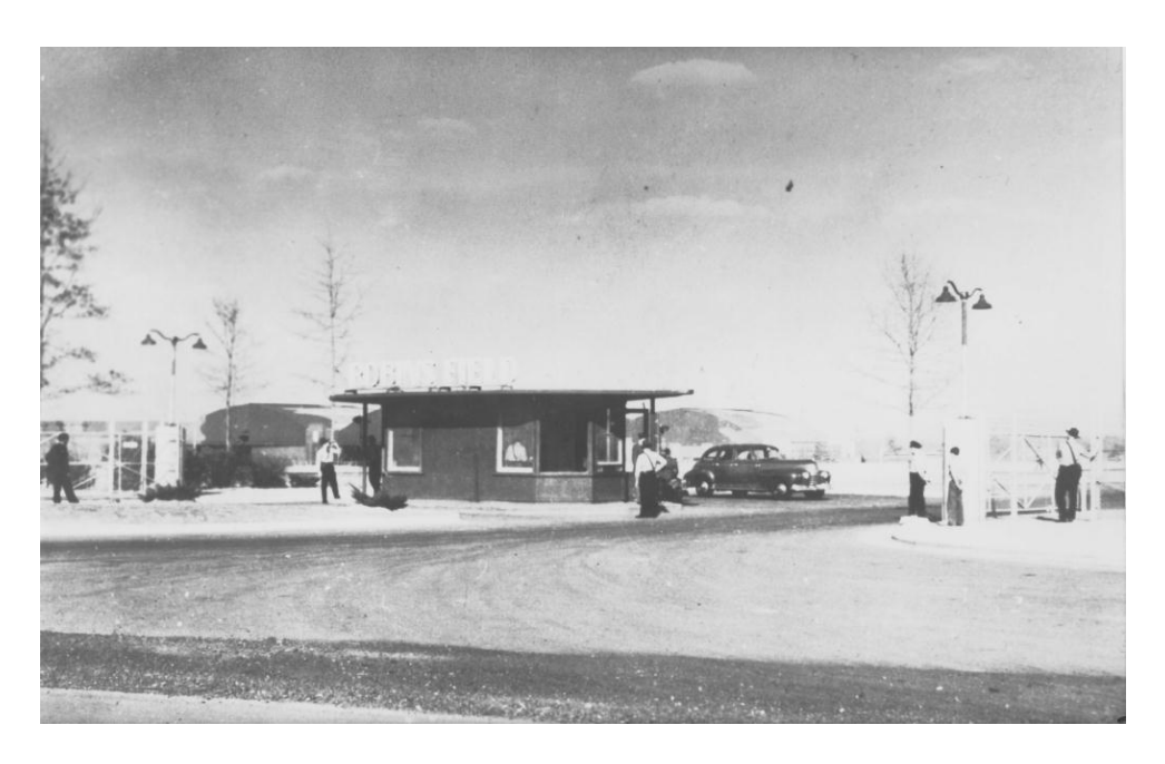
The main gate at Robins Field in the fall of 1943.