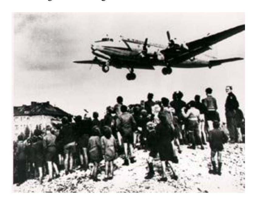
West Berlin children waiting for the pilots to drop candy as they land at Templehof Airfield in Berlin. It was one of the most dangerous approaches in the world according to one veteran pilot.