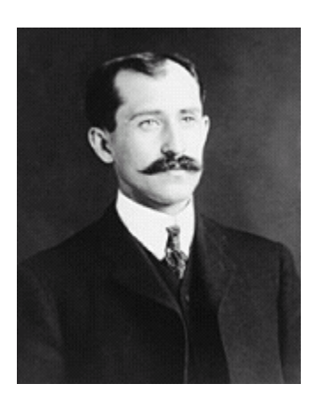
Orville Wright in 1909