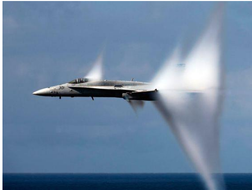
Fly a jet.