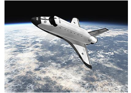
Go into space.