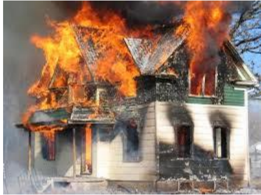
Fight a fire.

People would never think of doing these activities without proper personal protection,