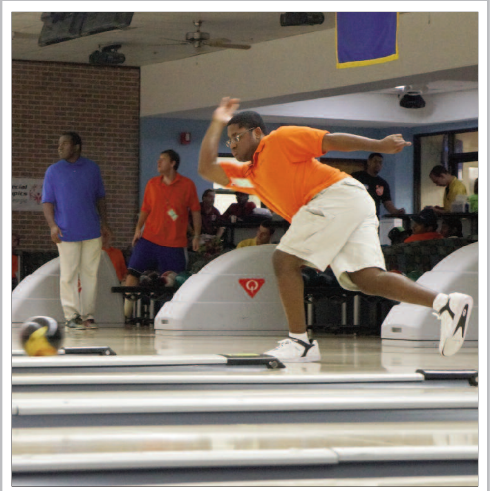
Clockwise from top, Special Olympics Georgia Masters Tournament participants celebrate after being awarded medals during the awards ceremony Aug. 23. A Masters Bowling Tournament bowler focuses on the ball after release as onlookers watch. A bowler practices perfect form. Each athlete received a medal or ribbon of achievement during awards ceremonies.