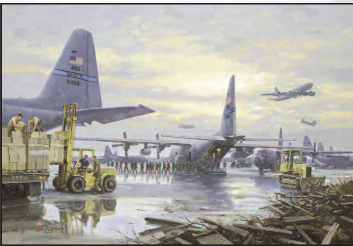
National Guard Heritage painting showing Hurricane Katrina relief efforts.