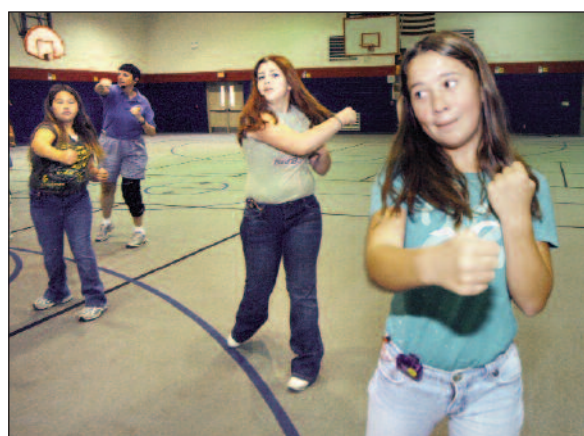
The Department of Defense’s message for young children and adolescents is called 5-2-1. It calls for five servings of fruits and vegetables a day, two hours or less of “screen time,” one hour of moderate to vigorous exercise and zero sweetened drinks.

Barnes said African-American-related health information will be posted throughout Robins in February.