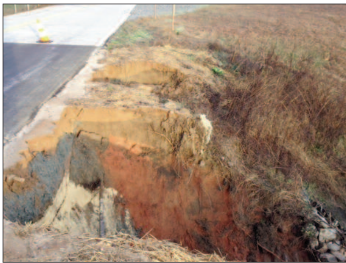
Right: Due to record-breaking rainfall, Robins has experienced an extreme road culvert failure on Perimeter Road at the northwest corner of the airfield. The road is currently closed.