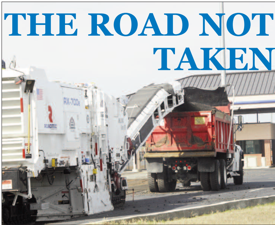
Above: A milling truck removes old asphalt on the southside of the Martin Luther King Gate Monday.