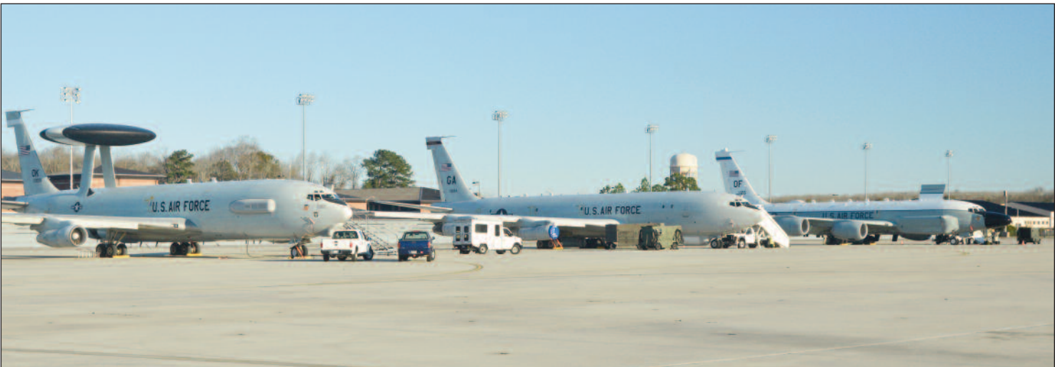
The Iron Triad sits poised and ready for action on the Team Joint STARS flight line Dec. 12. The triad includes, from left, the AWACS E-3, the Joint STARS E-8C, and the Rivet Joint RC-135 aircraft. Aircrews were here preparing for the Composite Unit Training Exercise off the east coast with sister services the Marines and Navy.

Robins contributes $85M When it comes to being more efficient and cost effective, Robins has contributed more than $85 million to date toward the "Road to A Billion and Beyond" initiative. The plan was implemented earlier this year. To learn more about Robins' role, visit www.robins.af.mil .