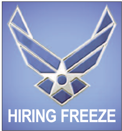
U.S. Air Force graphic

The temporary hiring freeze applied to all positions which were