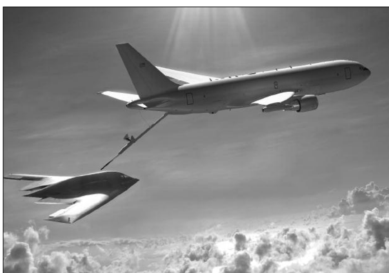
U.S. Air Force illustration

A KC-46 conducts in-flight refueling on a B-2 bomber in this illustration. The first KC-46 is expected to fly in 2015.