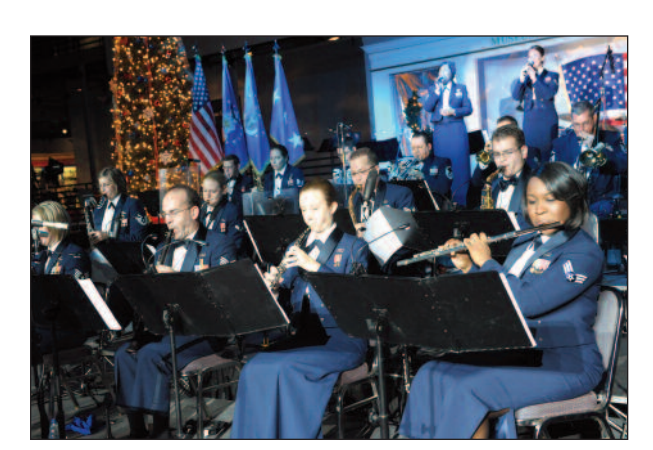
The Band of the U.S. Air Force Reserve performs during a past Holiday Concert at the Museum of Aviation. More than 800 Warner Robins community members gathered for the holiday event.