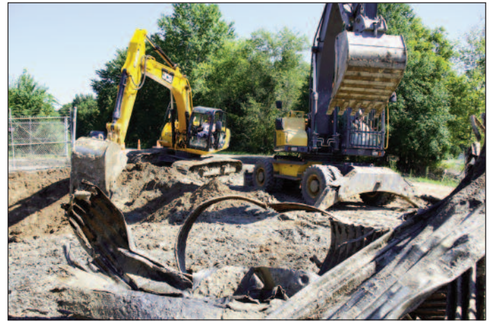
Workers remove partially collapsed drainage pipes from Hannah Road.

“This area collects water from First Street, south of the runway and behind the sanitation plant,” said Wilson Jones, 78th Civil Engineer Squadron civil engineer. “As these big pipes age, we keep a close watch on them to make sure they don’t fail.”