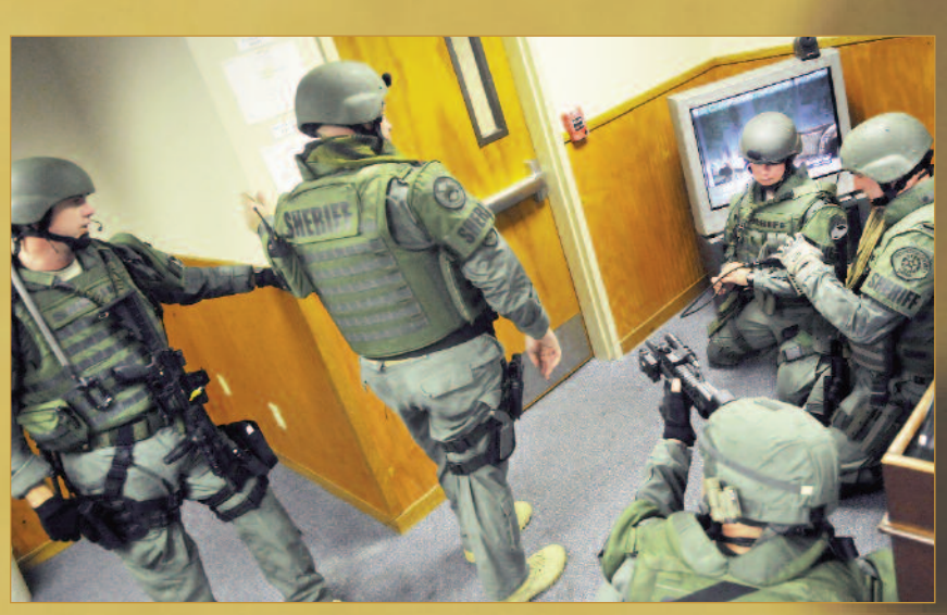
Above, Houston County Sheriff Department personnel use fiber optic technology