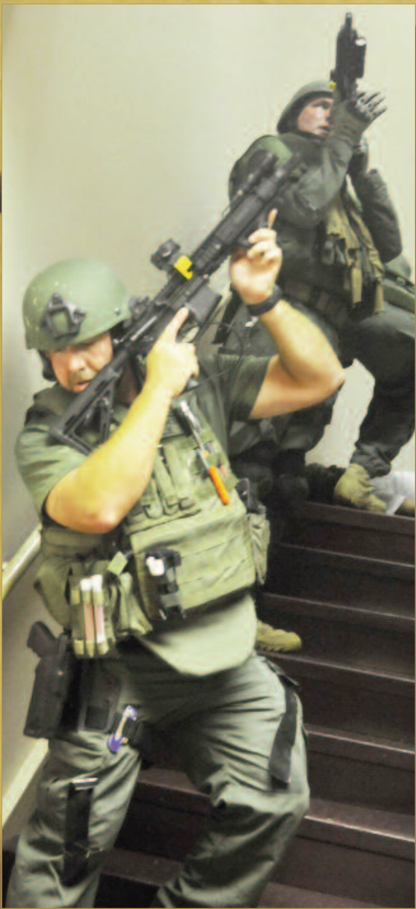
Houston County Sheriff's Department personnel search a stairwell in Bldg.

Inset left, an Airman portraying a shooter leads a hostage to a holding area as part of the scenario.