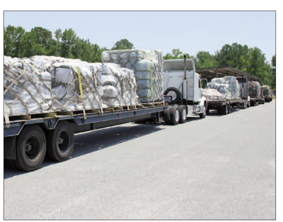
Four flatbed trucks loaded with communications equipment stand ready.