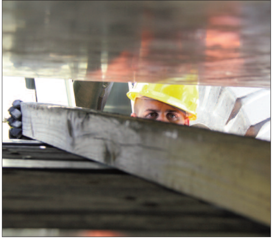
An Airman places dunnage between a pallet and a truck bed.