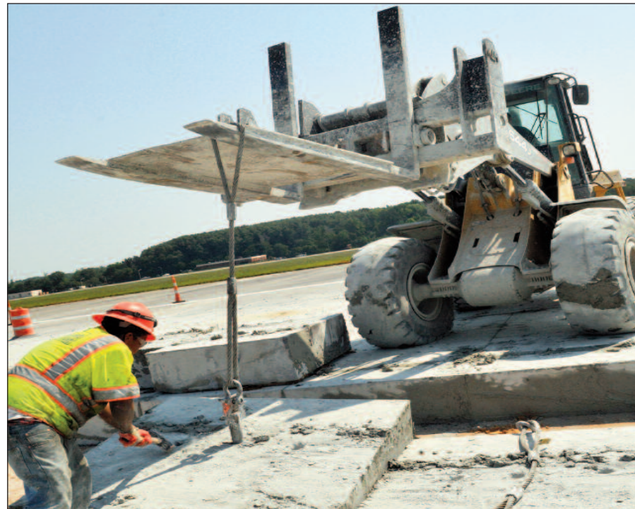
Workers remove concrete slabs from the Runway 33 touchdown zone. Weather permitting, construction is slated for completion next week.