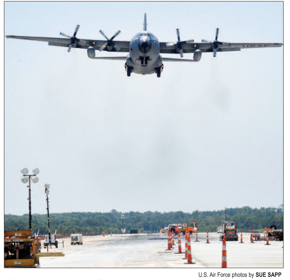
A C-130 on approach for landing flies over the area of the Robins runway undergoing concrete slab replacement. The 12,001-foot-long runway has been reduced to 8,000 feet of operational length during the construction.