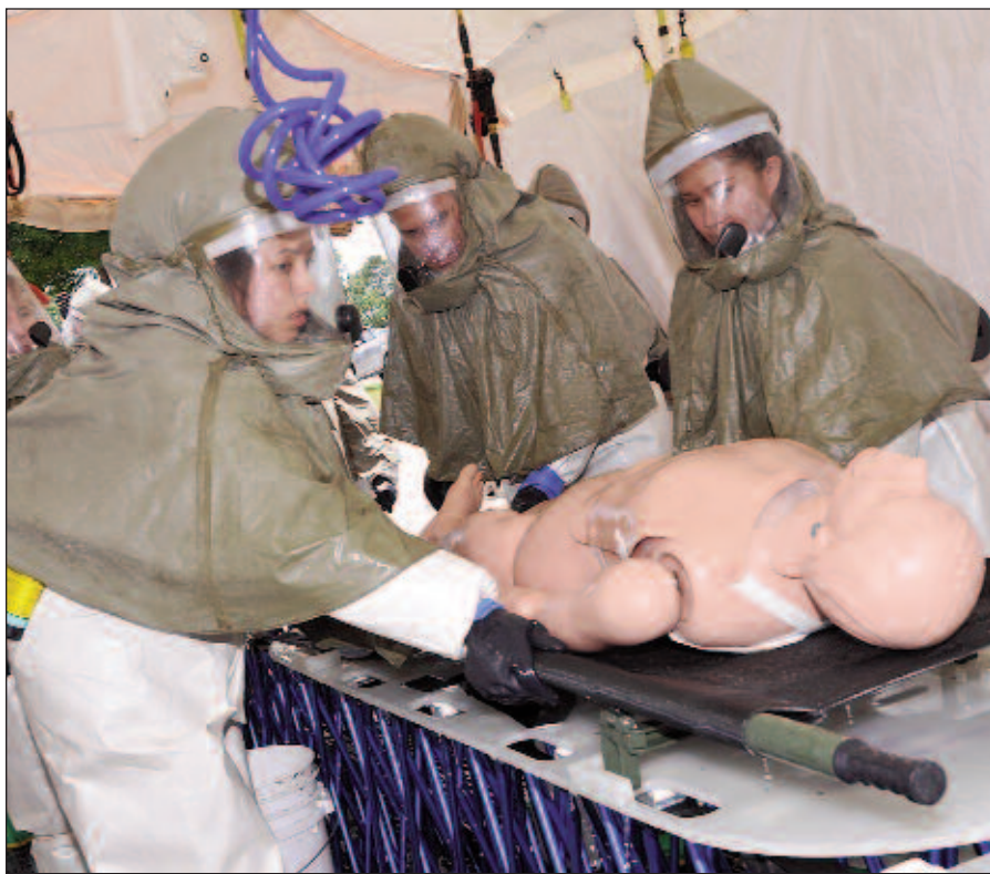
Airmen from the 78th Medical Group decontaminate a simulated victim during the In-Place Patient Decontamination Exercise.