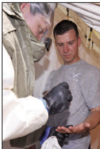
An Airman simulating being exposed to hazardous substances goes through the decontamination process during the In-Place Patient Decontamination Exercise. The exercise teaches IPPD team members to quickly set up a shelter to decontaminate patients who could be exposed to chemical spills or other harmful substances.