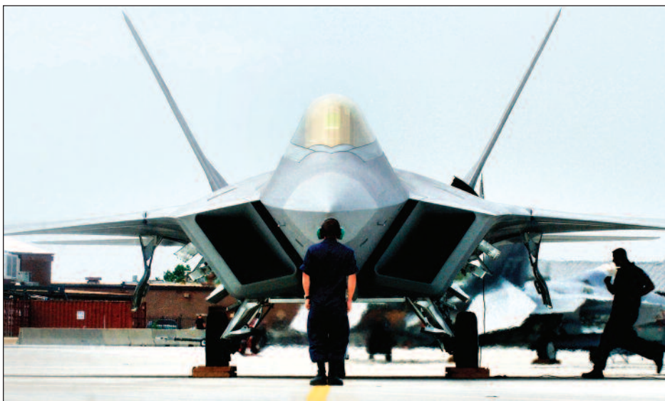
F-22A Raptor maintainers prepare to launch an F-22A Raptor Demonstration Team jet.