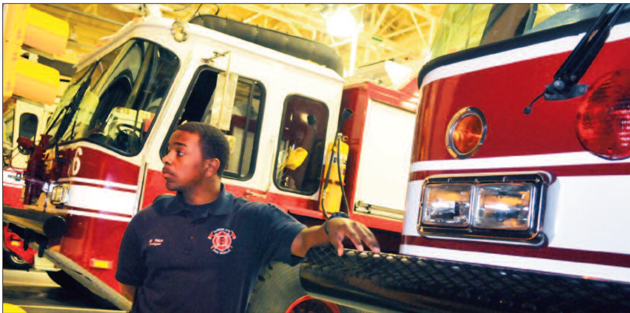
White looks over the flightline from the bay area of the fire station.