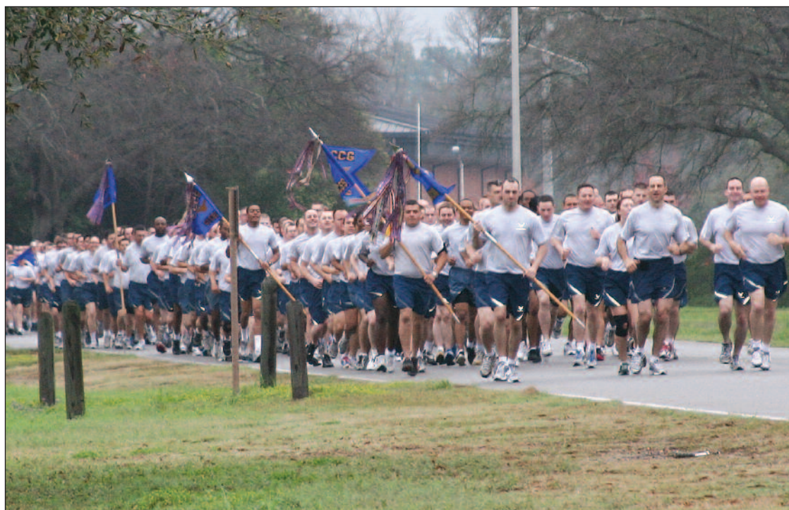
Airmen from the 5th Combat Communications Group participate in a Warrior Run at 7 a.m.