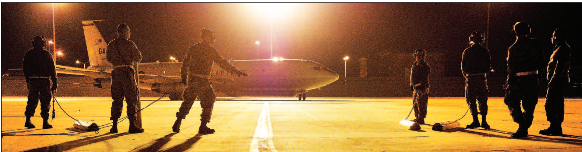
Crew chiefs from the 116th and 461st Air Control wings catch an E-8 Joint STARS returning from a night mission. The crew chiefs wait as the aircraft is marshaled to its parking spot so they can perform post-flight checks and ensure the aircraft is ready for its next mission.