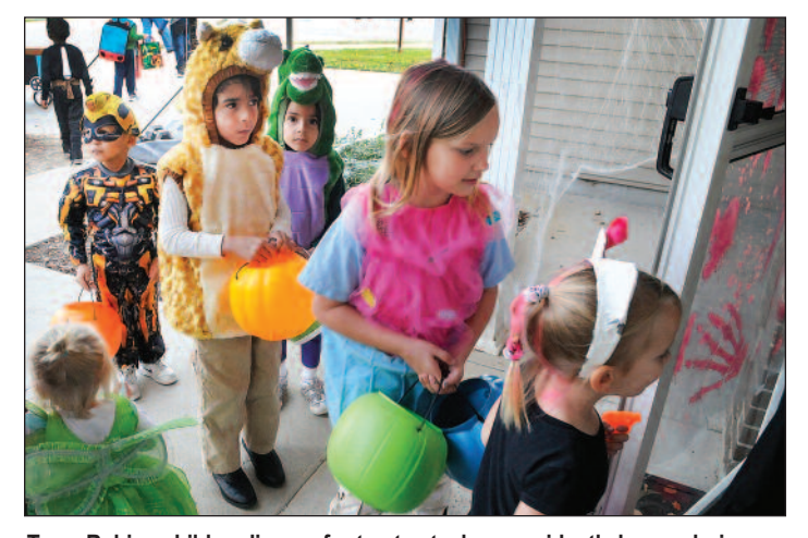
Team Robins children line up for treats at a base resident's house during this year's Halloween Trick or Treat festivities. The base observed the yearly tradition from 6 to 8 p.m.