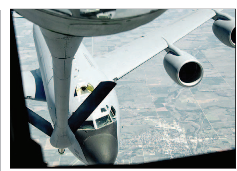
A KC-135 Stratotanker refuels another KC-135 during a refueling mission. Five refuelers will be at Robins temporarily from Aug. 7-20.