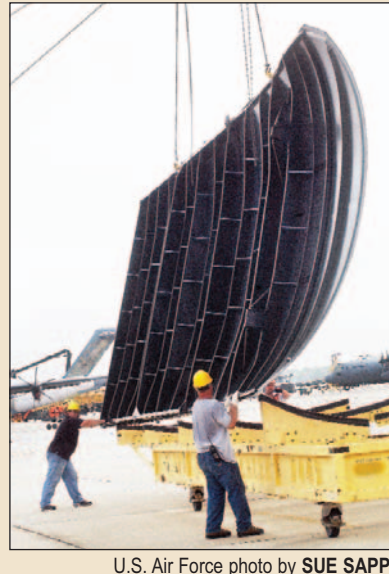
C-5 maintainers guide a C-5 aft cargo door from a crate onto a cradle July 27.

The door weighs five tons, and is 48 feet long and 10 feet wide. Because it's such a large part, and isn't replaced very often, careful planning was done to ensure the part was transported and off-loaded safe-