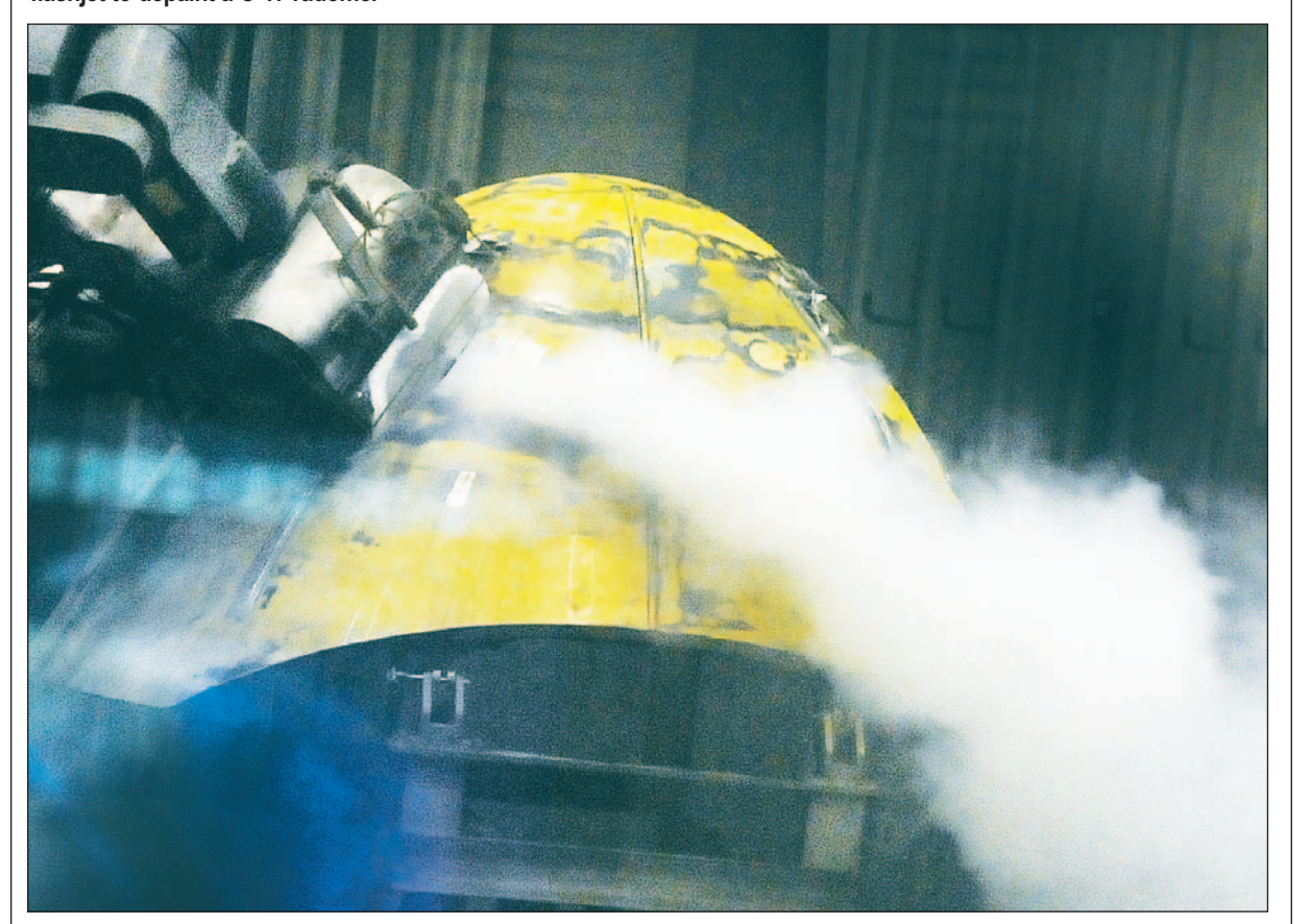
A flashjet removes paint from a C-17 radome. The environment-friendly machine uses a stripping head to burn paint off. Then, a vacuum subsystem removes the burnt paint.