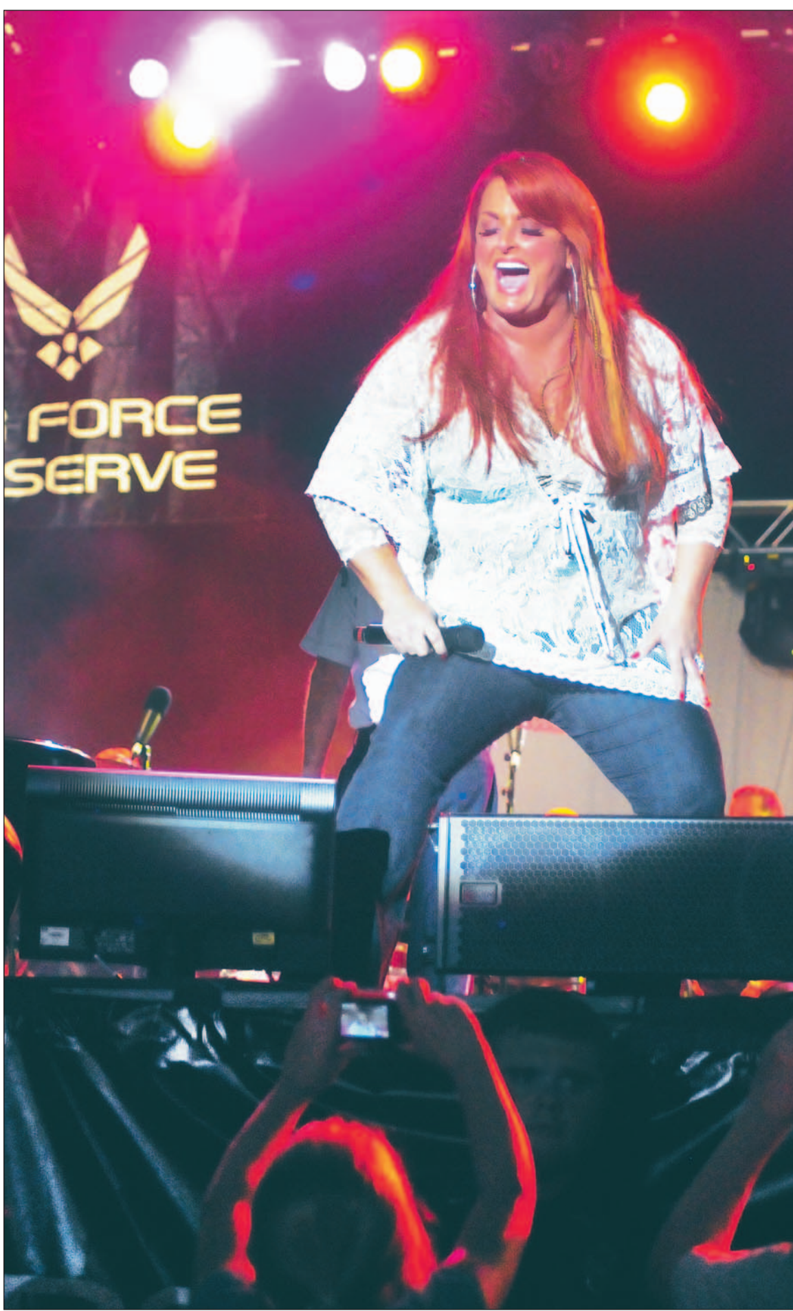
Wynonna Judd pauses during her performance to allow a youth to take a close-up photo.