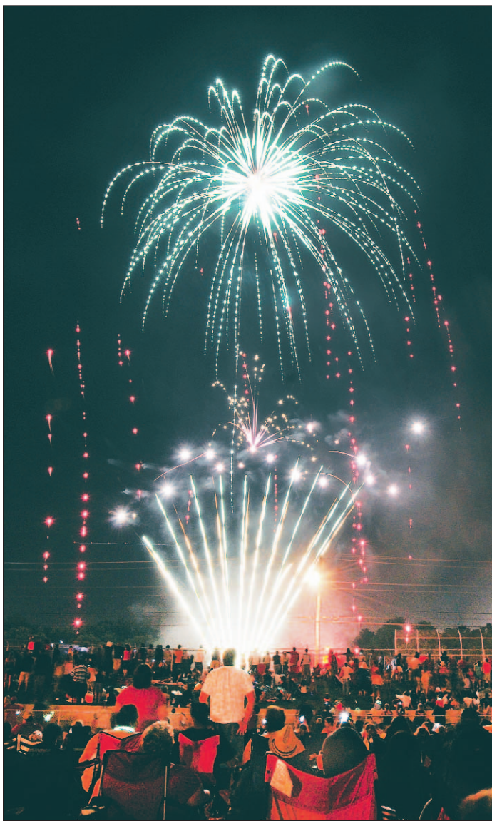
A fireworks display lights up the sky to top off the evening.