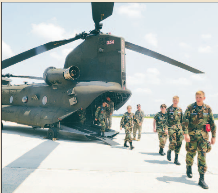
CAP members exit an Army Chinook helicopter. They were given a flight during the group's encampment at Robins.