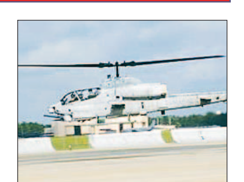
AH-1W Super Cobra attack helicopters like the one pictured here will be used during the exercise.

The earlier inspections were centered on the 402nd Maintenance Wing's composite flight, which is responsible for overhauling various bonded structures on F-15, C-130 and C-17 aircraft, and resulted in the Center receiving 13 citations in May.