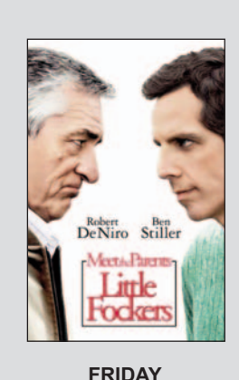
7 P.M. LITTLE FOCKERS