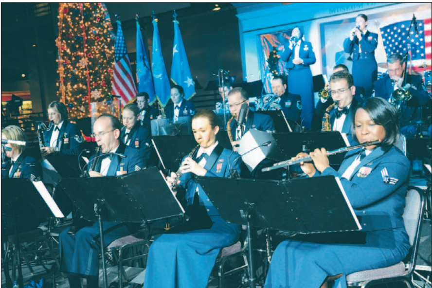
The 45-piece concert band headlined the holiday concert. This ensemble is the largest element of the Reserve Band, with a varied repertoire which ranges from classical overtures and Sousa marches to Broadway show tunes, popular music, movie themes, patriotic favorites and holiday songs.