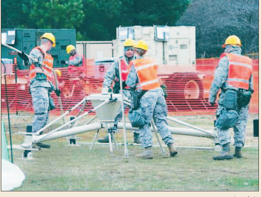
689th Combat Communications Wing members set up a tactical satellite dish during the recent ORI portion of the unit's inspection.

"Special thanks goes to the outstanding host base support from the 78th Air Base Wing," she said. "We couldn't have succeeded without them."