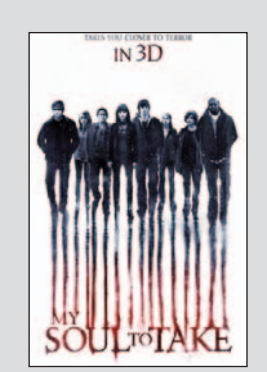
FRIDAY 7 P.M. MY SOUL TO TAKE R