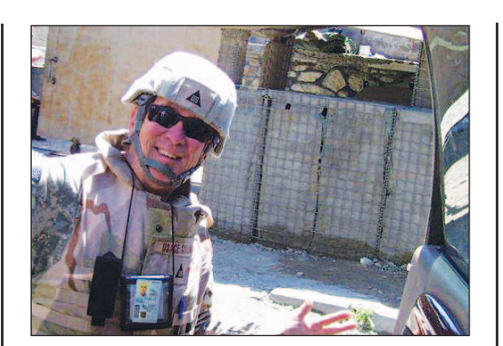
DEPLOYMENT page 8A

Robins Air Force Base has an annual federal payroll of $1.6 billion and a federal retiree payroll of $617 million.