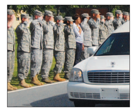
FINAL SALUTE page 3A