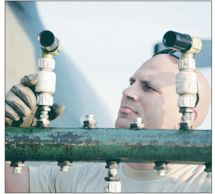
A member of the Air Force Reserve Command's 910th Airlift Wing, Youngstown-Warren Air Reserve Station, Ohio, assists with oil spill containment efforts in Mississippi.