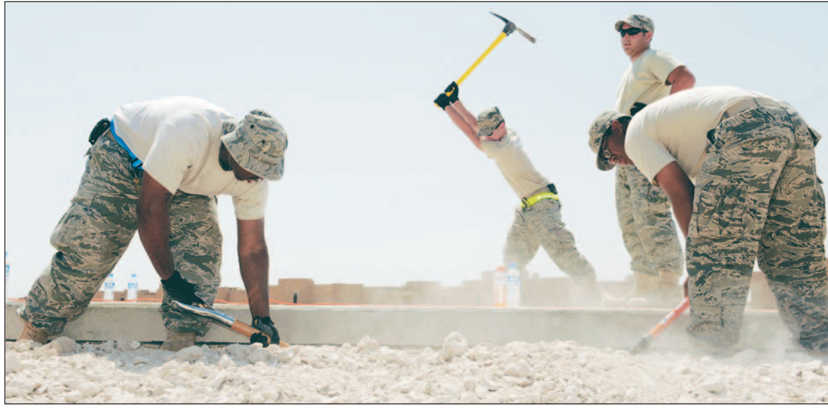
Airmen from the 379th Expeditionary Civil Engineer Squadron's electrical systems section dig trenches for new area lighting at an air base in Southwest Asia.