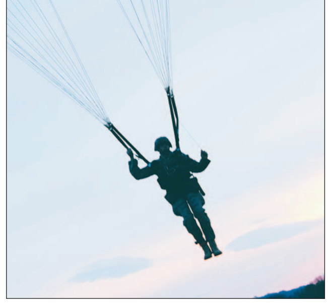
An Airman descends during a multi-nation jump in Pau, France. The jump culminated a week of training involving U.S. and French troops.