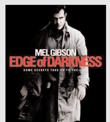
SATURDAY 6:30 P.M. EDGE OF DARKNESS

Tickets $4 adult; $2 children (11 years and younger). For details, call the base theater at 926-2919.