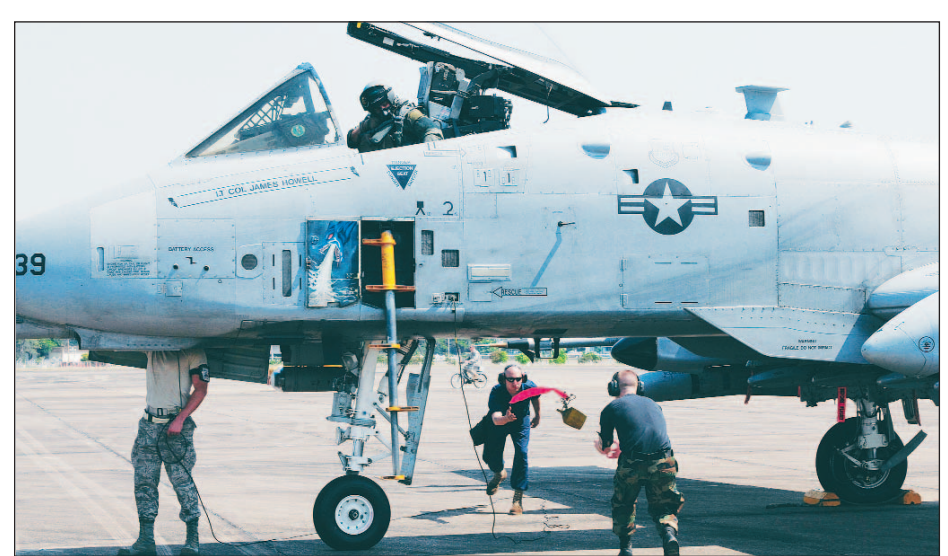
Airmen from the 25th Aircraft Maintenance Unit at Osan Air Base, South Korea, prepare an A-10 Thunderbolt II for take-off at Udon Thani Royal Thai Air Force Base, Thailand. The Airmen were participating in an annual training exercise which involved military members from the U.S., Thailand and Singapore.