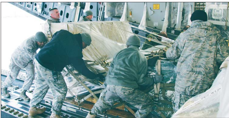
Members of the 5th Combat Communications Group push one of four pallets of equipment onto the C-17 Globemaster III which took Airmen in the unit to Haiti.

The DICE team will provide initial ground communication capabilities for an Air Force Expeditionary Medical Support