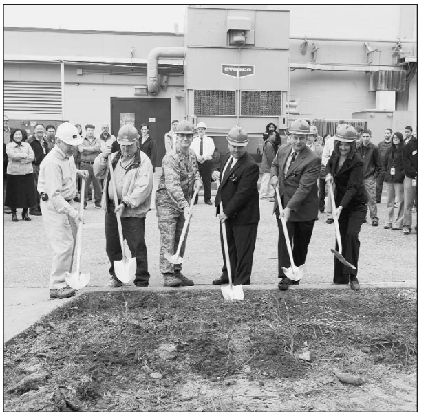
402nd Software Maintenance Group team members look on as ground is broken for the new C-5 simulator facili