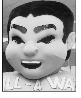
Commander Kill-A-Watt Robins energy mascot

What is your favorite tip to save water at home?