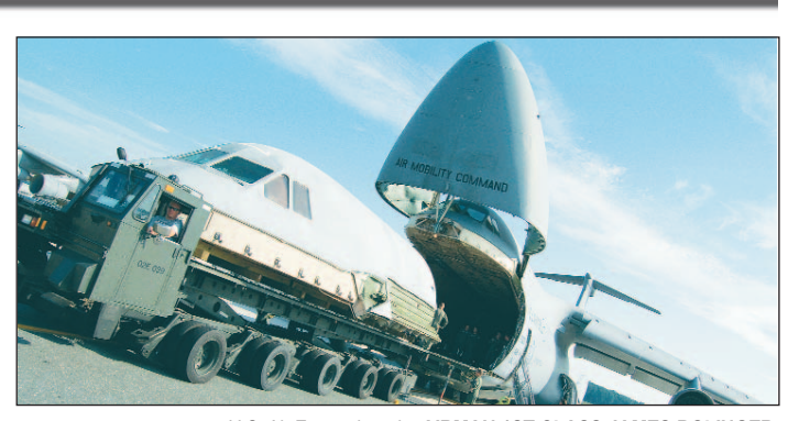
Airmen from Dover Air Force Base, Del., load a C-5 Galaxy flight deck onto another C-5 for transport to Robins in 2006. The flight deck will be used as a simulator to help train and test aircrews.