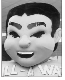
Commander Kill-A-Watt Robins energy mascot

"By keeping tires properly inflated and reducing vehicle weight by removing unneeded items from the trunk."