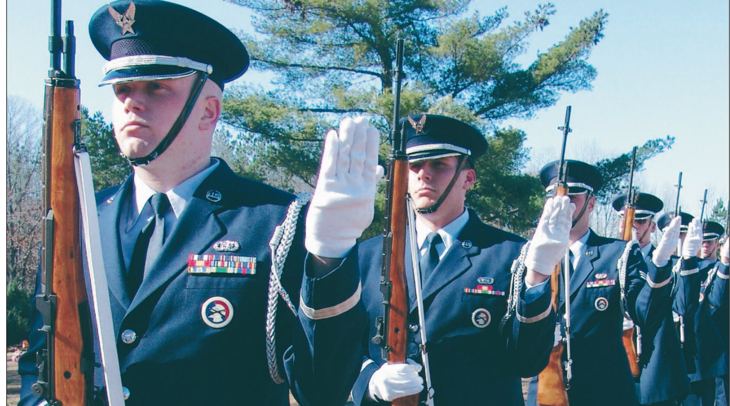
The 78th Air Base Wing Honor Guard conducts a three-volley salute for a deceased Air Force veteran.

The unit has an electronic bugle that makes it appear the person holding it is playing but the sound is actually generated by the bugle itself. People never know the difference, Sergeant Royster said, and there have been times when people have complimented the person holding the bugle on the perceived performance. When they do active-duty funerals, they usually try to get a real bugler from the Band of the Air Force Reserve.