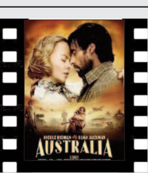
JAN. 10 — 7:30 P.M. AUSTRALIA RATED PG-13

to World War II, English aristocrat Lady Sarah Ashley inherits a cattle station the size of Maryland. When English cattle barons plot to take her land, she reluctantly joins forces with a roughhewn stock-man to drive 2,000 head of cattle across hundreds of miles of the country's most unforgiving land, only to still face the bombing of Darwin, Australia.