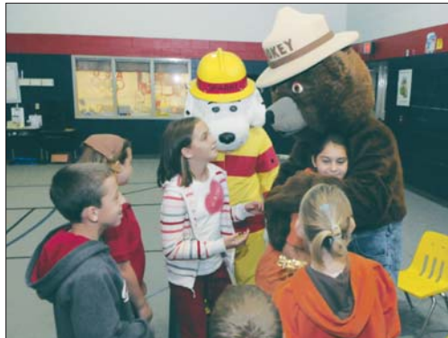
Above, Sparky the Fire Dog and Smokey Bear visit with Robins Elementary students

Robins Elementary pre-kindergarten students have their chance to tour the Fire Safety House Oct. 9. Children learn safety tips for the kitchen, living room and bedroom and bedroom and are taught how to call 911 and make an escape from a house in the event of a fire.