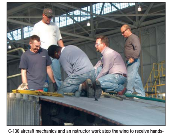
on training during class Nov. 30

be good for new people coming in with no experience. "We'll have less trouble down the road," he said.