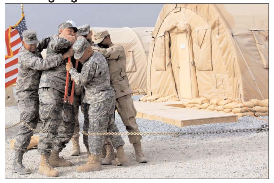
A group of commanders work together to cut a chain for the grand opening of the new convoy support center Nov. 24 in Southwest Asia. The new eight-tent center consolidates all of the Air Force convoy support functions into one area.