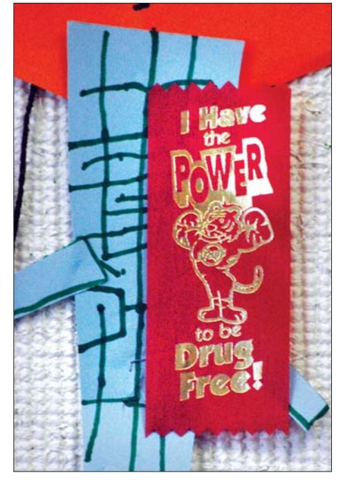
Robins Elementary observed Red Ribbon Week Oct. 23-31. The week-long campaign promotes a drug-free lifestyle.

"I pledge to lead a drug-free life because I want to be happy and healthy. I will say no to alcohol, tobacco and illegal drugs and "yes" to my own self-worth. I will encourage my friends to join me and to stand up for what is right."