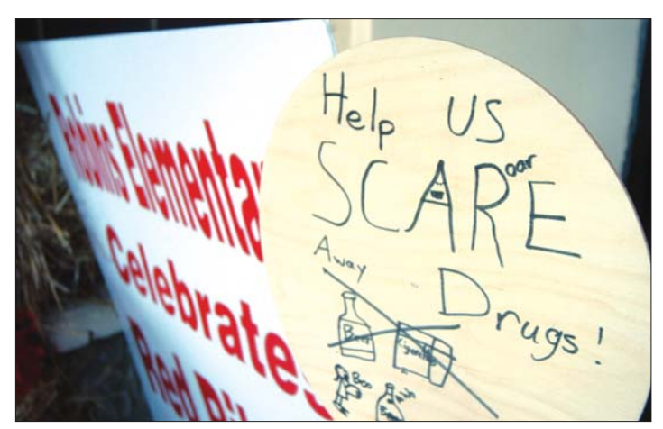
Robins Elementary students wore costumes to "Scare drugs away from Robins."