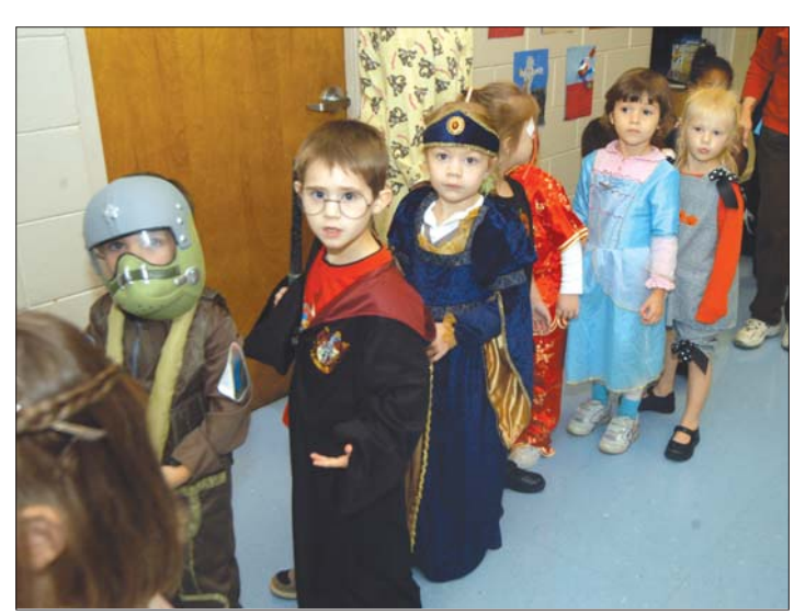
Robins Elementary kindergarten students line up in the hall during a costume parade throughout the school on Halloween, which was "Scare drugs away from Robins" day.