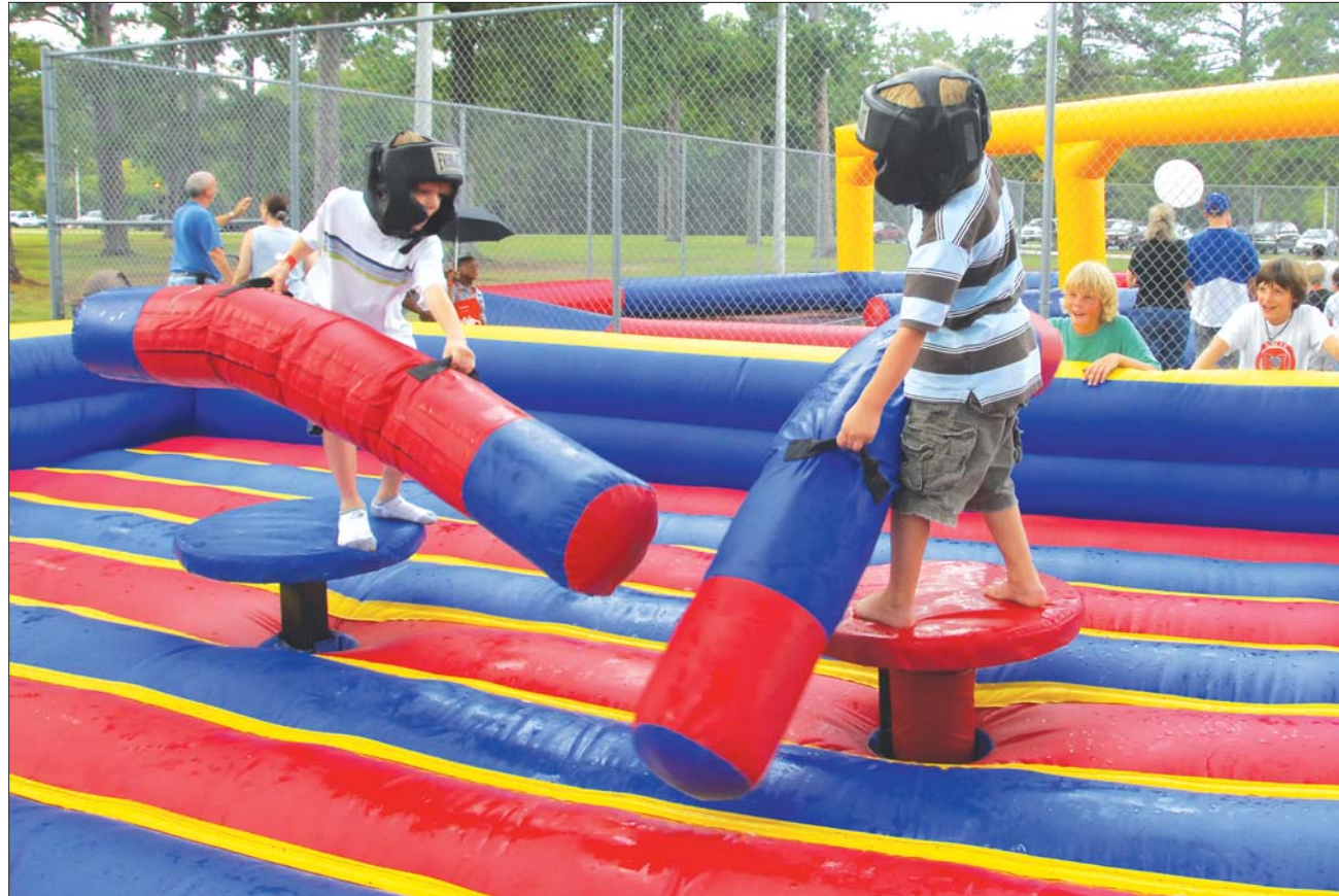
Two young attendees test each other's balance at the Let's Celebrate Summer Bash at Robins Park Sept. 22 while they are cheered on by onlookers.