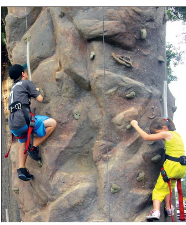
Above, A rock climbing wall was one of the attractions at this year's Summer Bash.

et's Celebrate Summer Bash was held at Robins Park Sept. 22. The event, which included rides, special entertainment, face painting, games and prize drawings was a way to bid farewell to summer 2007. Food and beverages along with fit for fun events presented by the fitness center helped turn a day dampened by early showers into a great success. Activities included singles horseshoes; a punt, pass and kick competition for kids and adults and an adult 5-on-5 dodge ball tournament.