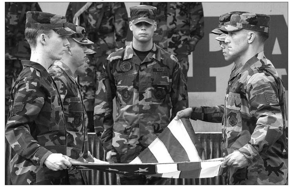
The American Flag is folded by members of the 8th Fighter Wing during the Prisoner of War and Missing in Action Ceremony Sept. 21 at Kunsan Air Base, South Korea. Sept. 21 is National POW/MIA Recognition Day.