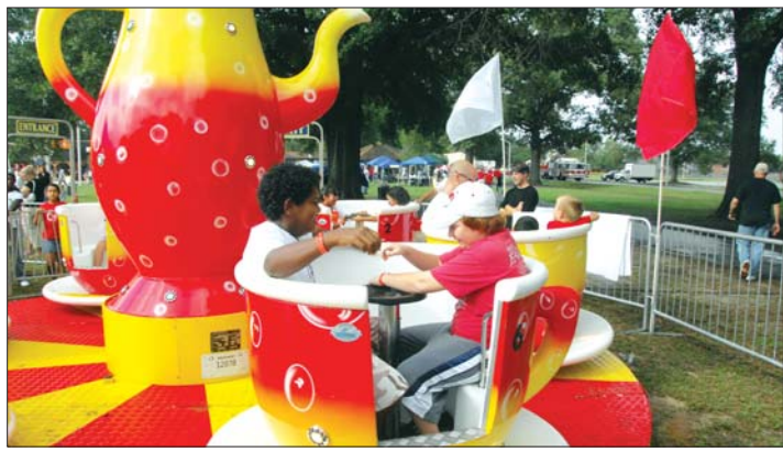
Top, Arts and crafts were among the day's activities during Let's Celebrate Summer Bash Sept. 22. Center, Activities like the bungee jump gave Summer bash attendees a chance to reach new heights. Bottom, The teacup ride was a hit with young and old alike.