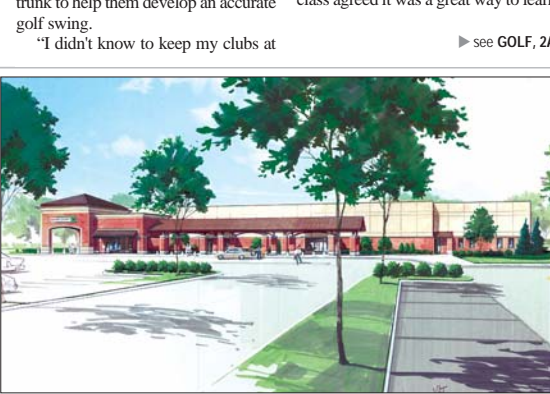
Above is an artist's rendering of what the new Robins Commissary will look like. The 15-month construction project is expected to be complete in the fall of 2008.