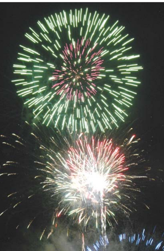
Spectacular fireworks light the sky during the 2006 Independence Day concert.