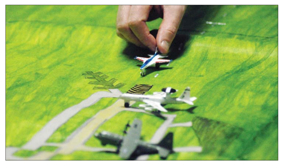
Before the simulator arrived, air traffic control journeymen and apprentices trained using a static board with toy airplanes to run scenarios.

However, the trainers also put a little mischief into the scenarios in the name of fun. One of the traffic calls that is a simulator exclusive is, "You disobeyed orders, now you must suffer the consequences." This call is followed by the immediate combustion of the simulated aircraft. Even