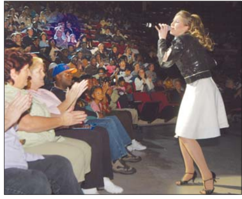
Above, a Tops in Blue vocalists interacts with the audience

"When this tour is over I look forward to meeting people in my squadron who have been supporting me and han-dling paperwork and things for me and putting faces to names," he said. me