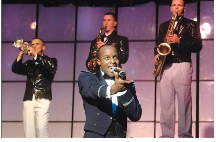
Tops in Blue, the Air Force's expeditionary entertainers share the many facets of love as they presented "What's Love" Tuesday at the Warner Robins Civic Center.

around 50,000 pounds of equipment for each show. Helping with the production of this year's show are two members of Team Robins –