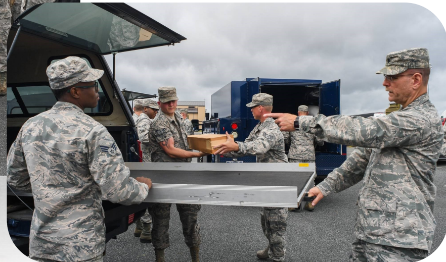
Above and right: Airmen from the 202nd Engineering Installation Squadron and 116th Maintenance Group, Georgia Air National Guard, gather for a roll call and briefing before loading equipment prior to deploying Sept. 12, 2017.