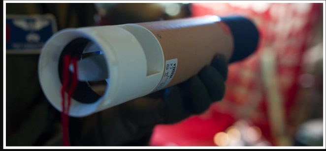
Above: A dropsonde is an externally dropped sensor used to provide accurate weather data to the National Hurricane Center on approaching hurricanes.

The two airmen flew two missions passing through the eye of Hurricane Irma eight times before heading home after 22 hours of flight time with the 53rd WRS.