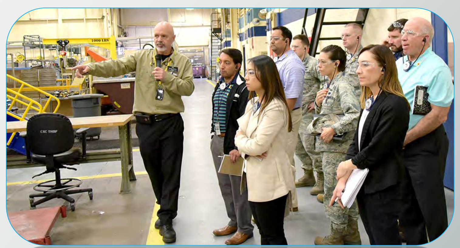
Continued from previous page

This is the second-ever ATAC class. The first assembled in the fall with a different problem to address. Humphrey said the members of the class are hand-picked after being nominated by their supervisors.