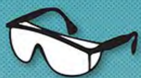
Laser Safety Goggles